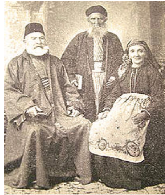
1914. SEPHARDIC FAMILY, BOSNIA