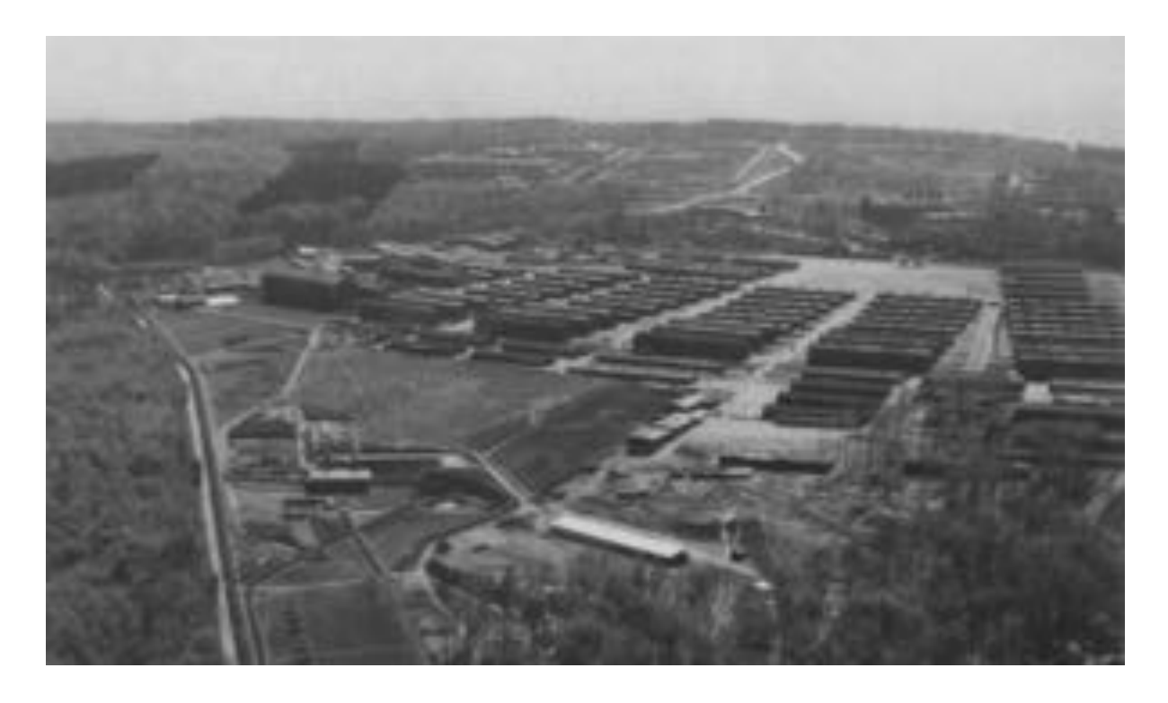
Image: Aerial photograph of Buchenwald Concentration Camp, taken by the U.S. Airforce following liberation. End of April 1945. (Attribution: U.S. Air Reconnaissance. National Archives Washington)

Cover image: Laszlo Nussbaum in Buchenwald, 1945.