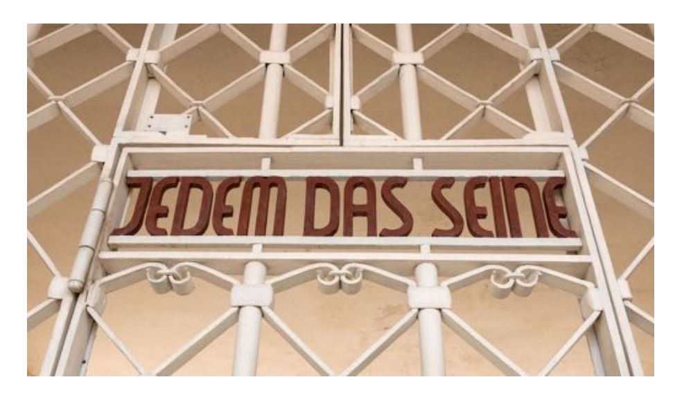
Image: Entrance gate of the Buchenwald concentration camp, inscribed Jedem das Seine ("To each his own").

Image: Gatehouse of Buchenwald Concentration Camp Memorial. Note the clock, whose time is permanently set at 3:15 PM, the moment of the liberation by U.S. troops.