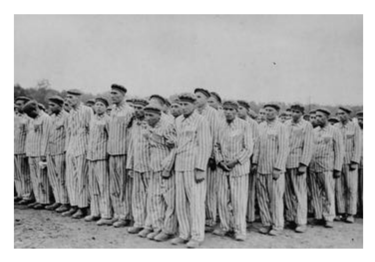
Image: Prisoners standing during roll call in Buchenwald. Each wears a striped hat and uniform bearing colored, triangular badges and identification numbers.

Concentration Camp System: In Depth. Holocaust Encyclopedia, United States Holocaust Memorial Museum. <a href="https://encyclopedia.ushmm.org/content/en/article/concentration-camp-system-in-depth?series=10">https://encyclopedia.ushmm.org/content/en/article/concentration-camp-system-in-depth?series=10</a>