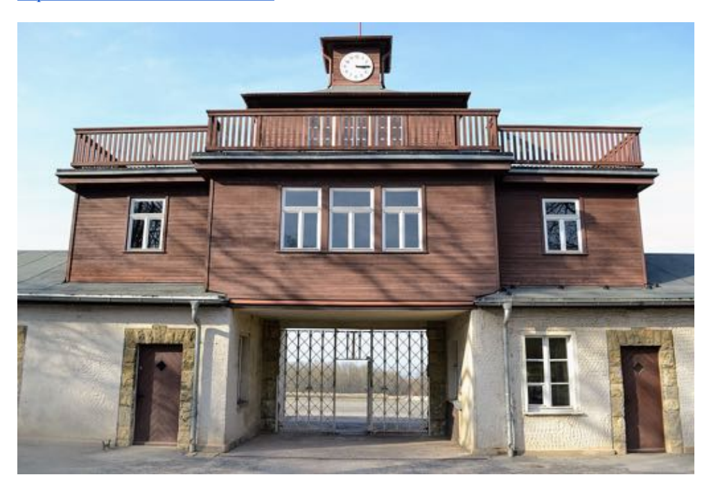
Image: Gatehouse of Buchenwald Concentration Camp Memorial. Note the clock, whose time is permanently set at 3:15 PM, the moment of the liberation by U.S. troops. (Attribution: Chiode)

Source: Buchenwald Memorial. Buchenwald and Mittlebau-Dora Memorials Foundation. <a href="https://www.buchenwald.de/en/72/">https://www.buchenwald.de/en/72/</a>